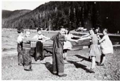
Alaska State Library - Historical Collections

It is worth a visit to the new store just to see this picture as well as perusing the other amazing and enchanting photos of children. The show will be up until March 23. The new store is open from 11:30 to 6:30 PM Tuesday through Saturday. After March 23, look for something new coming to the store gallery. It is always worth stopping in to see what's up on the wall!